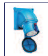
Female Receptacle with Angle Adapter 37-24043 + MA20